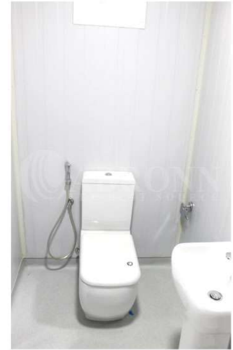
TOILET & WASHROOM